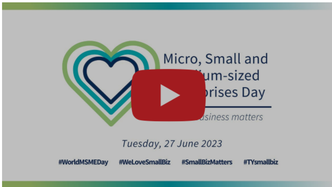
Micro, Small and Medium-sized Enterprises Day