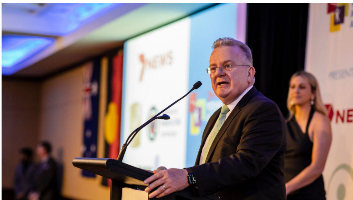
The Ombudsman, Bruce Billson, at the 7NEWS Young Achiever Awards in Queensland