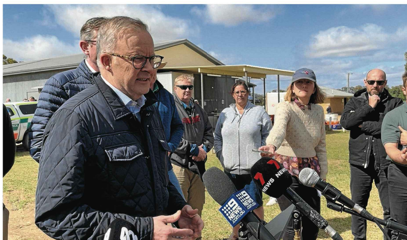
Prime Minister Anthony Albanese in Eugowra on Tuesday announcing extra funding for small business and local governments.

The dual funding announcements come on the back of Prime Minister Anthony Albanese's trip to Eugowra on Tuesday, where he, alongside the NSW Premier